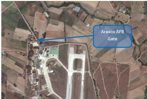
Araxos AFB Gate